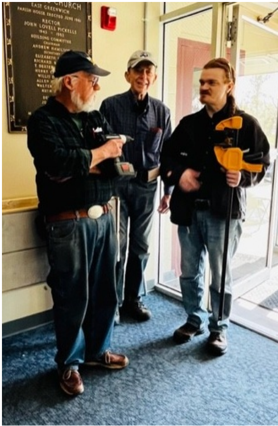
Christ's Community Kitchen Dinner