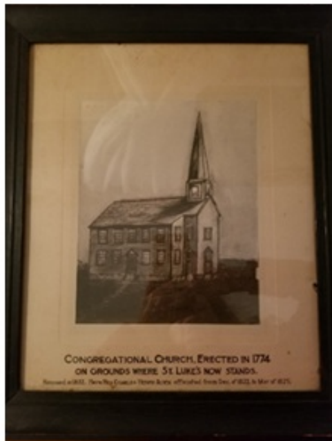
First church on the site: Catholic Congregational Society, 1776

Many items from the “first” St. Luke’s Church are still in use here. Look at the framed picture in the rear of the Nave for several examples.