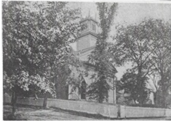
St. Luke's Church Consecrated April 17, 1834