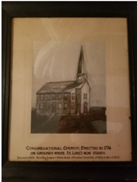
First church on the site: Catholic Congregational Society, 1776

Many items from the “first” St. Luke’s Church are still in use here. Look at the framed picture in the rear of the Nave for several examples.