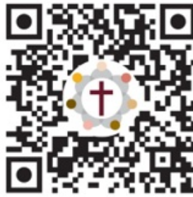
2024 Lenten Blog

To receive daily email notifications of daily blog posts, subscribe by clicking on the QR code below and entering your email address on the 2024 Lenten blog page. Or go to https://stlukeseg.org/lenten-blog-2024