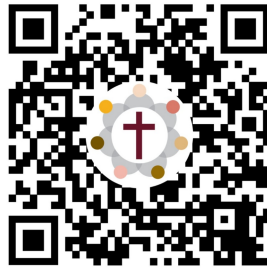
2022 Advent Blog

The season of Advent is here! Our St. Luke's Advent Blog is a wonderful resource for prayer and reflection. Posts are written by members of our St. Luke's community and based on the lectionary scripture assigned for each day from the beginning of Advent (November 27th) through Christmas (December 25th). Our faith community is a wonderful treasure, and it is a gift to be able to share this blog with you. Posts can be found on our Facebook Page.