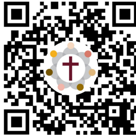
2022 Advent Blog