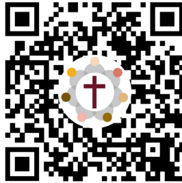
2022 Advent Blog