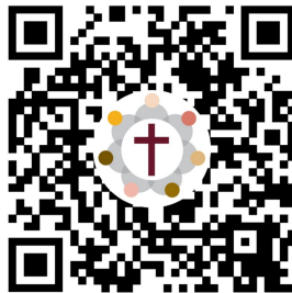
2022 Advent Blog