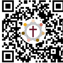
2022 Advent Blog