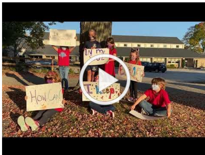
St. Luke's Choirs Sing For You!