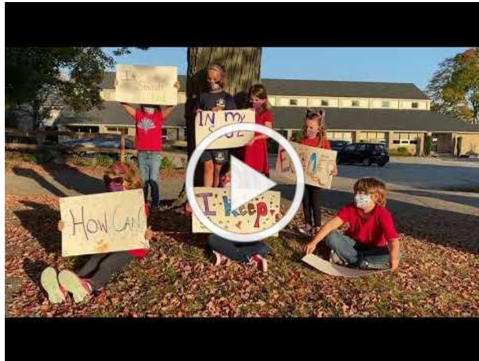
St. Luke's Choirs Sing For You!