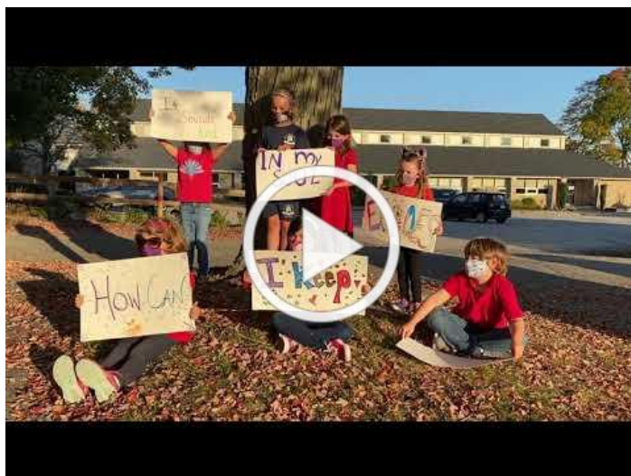
St. Luke's Choirs Sing For You!