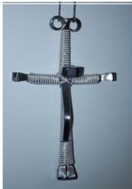
This Cross Belongs to Our Bishop