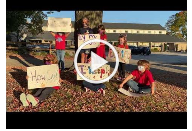
St. Luke's Choirs Sing For You!