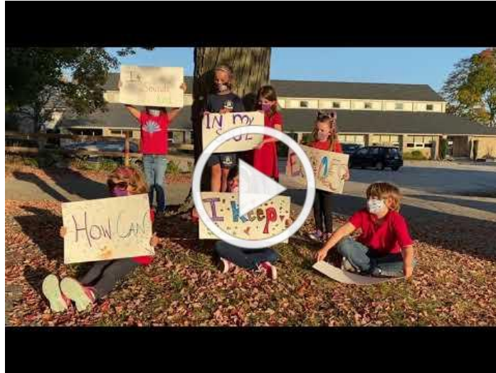
St. Luke's Choirs Sing For You!