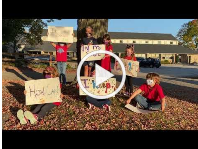
St. Luke's Choirs Sing For You!