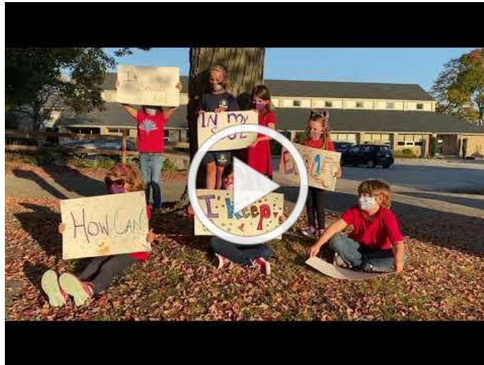
St. Luke's Choirs Sing For You!