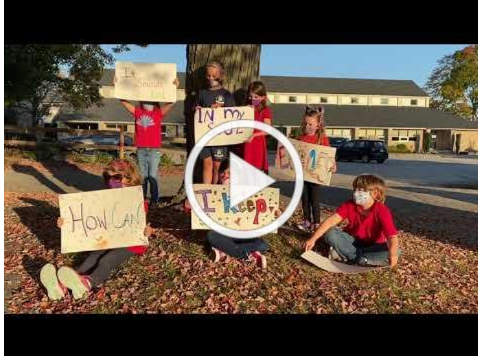
St. Luke's Choirs Sing For You!