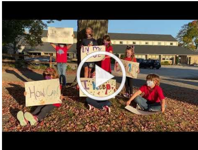
St. Luke's Choirs Sing For You!